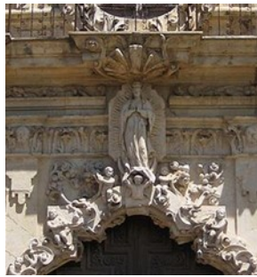
Central Stone Façade – Our Lady of Guadalupe – Misión San José y San Miguel de Aguayo

“Know for certain, littlest of my sons, that I am the perfect and perpetual Virgin Mary, Mother of the True God through Whom everything lives, the Lord of all things near and far, the Master of heaven and earth ... I am your merciful Mother. The merciful Mother of all of you who live united in this land, and of all mankind, of all those who love me. Here I will hear their weeping, their sorrow, and will remedy, and alleviate all their multiple sufferings, necessities and misfortunes ... Am I not here, I who am your Mother? Are you not under my shadow and protection? Am I not the source of your joy? Are you not in the hollow of my mantle, in the crossing of my arms? Do you need something more? Let nothing else worry you or disturb you.