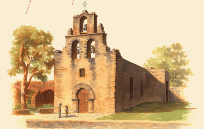
Mission San Francisco de la Espada

Mission San José y San Miguel de Aguayo is over 300 years old. Known as the "Queen of the Missions," it is one of the most active parishes in South San Antonio. The beautiful architecture, sculptures, paintings, and mosaics were created to share the Catholic Faith and lift the minds of all who entered the Church from earthly things up to the beauty and grace of heaven.