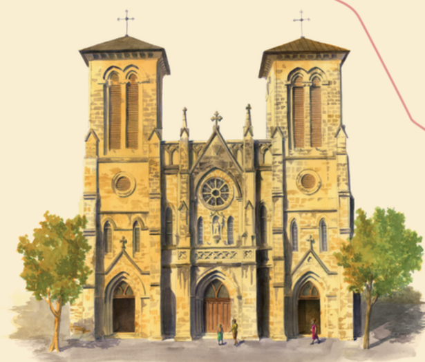
San Fernando Cathedral