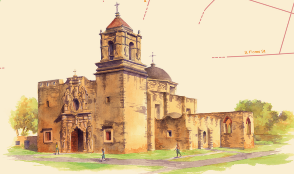
Mission San José

San Fernando Cathedral has been the center of life in San Antonio since the original church was built in 1750. The original church walls were incorporated into the current Cathedral. While not a mission, this church was closely connected to all the missions. As the oldest continuous functioning Cathedral in the United States, San Fernando represents the heart of San Antonio, past and present.