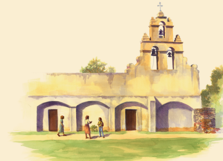
Mission San Juan

Mission San Juan Capistrano moved from east Texas to San Antonio in 1731. It is the closest mission to the San Antonio River that provided all the missions with water for their crops through an innovative series of acequias or water canals built by the mission Indians. These acequias are still visible, and at Mission San Juan you can experience history as the fields are still watered by an acequia in existence since the eighteenth century.